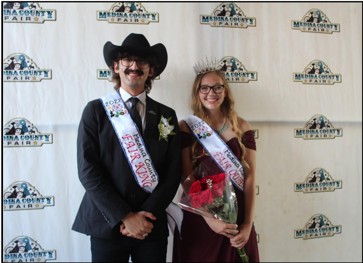
King Elian Zayed